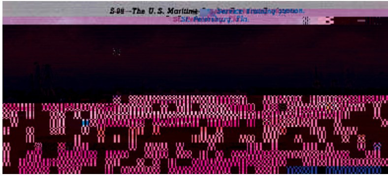
Fig. 1. Saint Petersburg Training Station circa 1942. View of training station from the sea. Vessel on left is the TV T a a; the TV V g is on the right.

the department an SUS “Center of Excellence.” Each state university received one—and only one—of these designations. For us, it led to the near doubling of the faculty because it prompted the Florida legislature to give us permission and funds to hire eight new faculty.